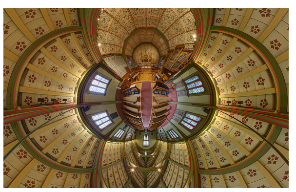
Fig. 4. Stereographic Projection of St. Andrew's Episcopal Church in Newcastle, Maine.