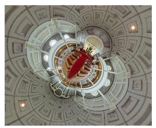
Fig. 6. Stereographic Projection of St. John's Episcopal Church in Portsmouth, New Hampshire.