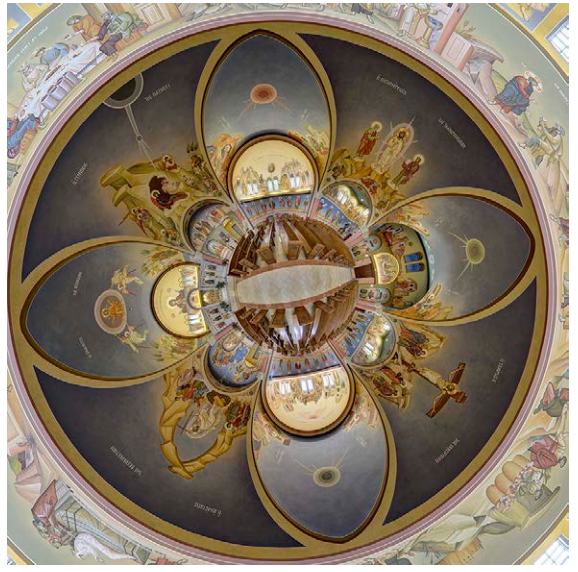
Fig. 8. Stereographic Projection of Saint Catherine Greek Orthodox Church in Braintree, Massachusetts. ©2017 Seth Thompson, Author.