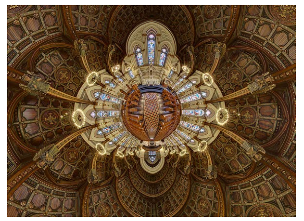
Fig. 2. Stereographic Projection of Saint Mary–Saint Catherine of Siena Parish in Charlestown, Massachusetts.

stereographic projection is attributed to Claudius Ptolemy, a mathematician, astronomer, geographer, and astrologer who lived in Alexandria, Egypt, in the second century CE; he referred to it as a planisphere projection . Ptolemy's Planisphaerium is the oldest surviving document that describes the stereographic projection. [20] By combining such notions as represented geometry and representational geometry, this author's work hopes to inspire an interfaith dialogue between religions by exploring religious philosophies through geometry while documenting sacred spaces.