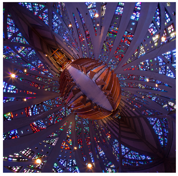
Fig. 7. Stereographic Projection of First Presbyterian Church in Stamford, Connecticut.