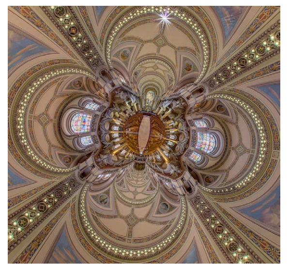
Fig. 1. Stereographic Projection of Saint Anthony of Padua Church in New Bedford, Massachusetts. ©2020 Seth Thompson, Author.

argued that 360° panoramic photography's twodimensional image projections mirror other geometry-based artistic practices such as Islamic pattern design. Using this author's ongoing project Sacred Spaces of New England and Hans Belting's book Florence and Baghdad: Renaissance Art and Arab Science as starting points, this paper compares and contrasts Islamic visual theory with Western pictorial tradition and examines Islamic pattern design drawing to root this author's 360° panoramic photography's two-dimensional image projections of sacred spaces into an artistic tradition, resulting in a body of work that is a conceptual hybrid of two seemingly disparate techniques-represented cultural geometry and representational geometry (figure 1).